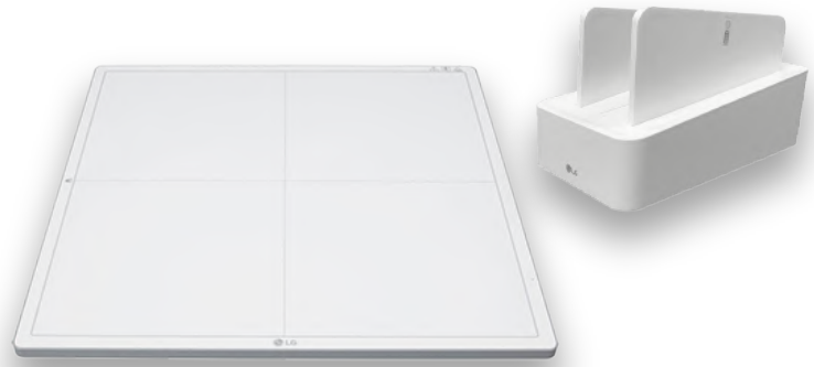
LG 14HK701G-W Detector with Battery Charging Station