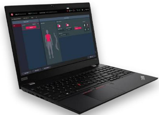
Lenovo P53 ThinkPad with LG Advanced Workstation Software (AWS)